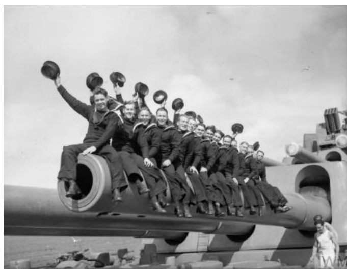
Photo appeared on the web page of Veterans and Heroes, showing members of the SA Royal Naval Volunteer Reserve serving on board HMS Nelson. The group is sitting on one of the 16 inch gun barrels of the ship.